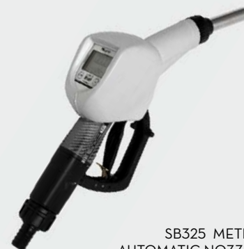
SB325 METER AUTOMATIC NOZZLE