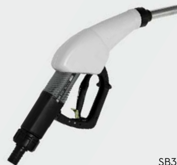
SB325 AUTOMATIC NOZZLE